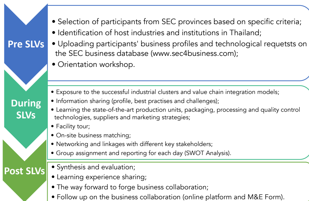
Figure 1: Flow of SLV